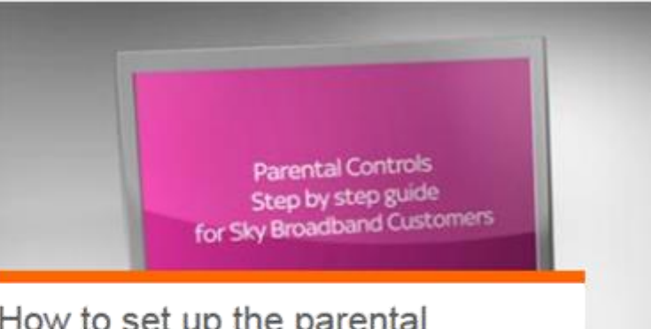
How to set up the parental controls offered by Sky

How to set up the parental controls offered by BT