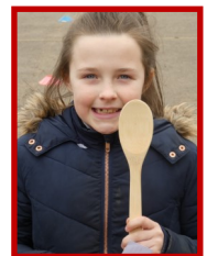
Winners of the much coveted K$2 Pancake Race - wooden spoon 2023!