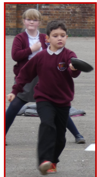
Pancake Races across school